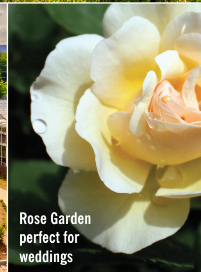
Rose Garden perfect for weddings