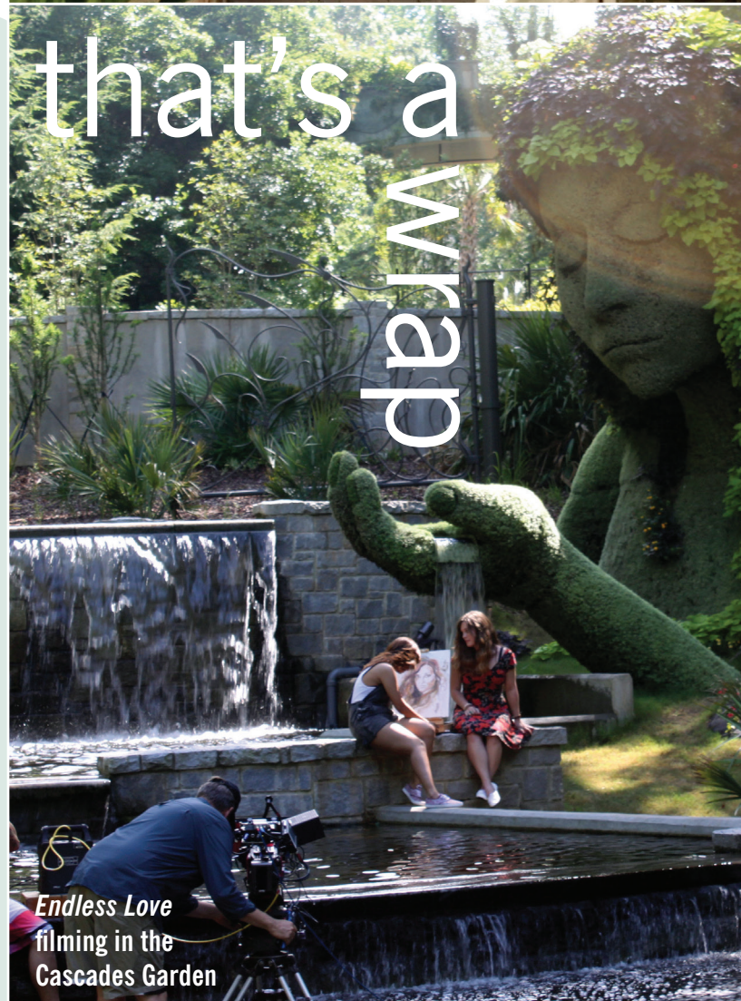
Endless Love filming in the Cascades Garden