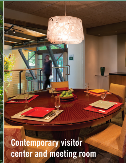
Contemporary visitor center and meeting room