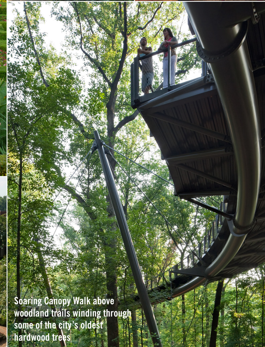
Soaring Canopy Walk above woodland trails winding through some of the city's oldest hardwood trees