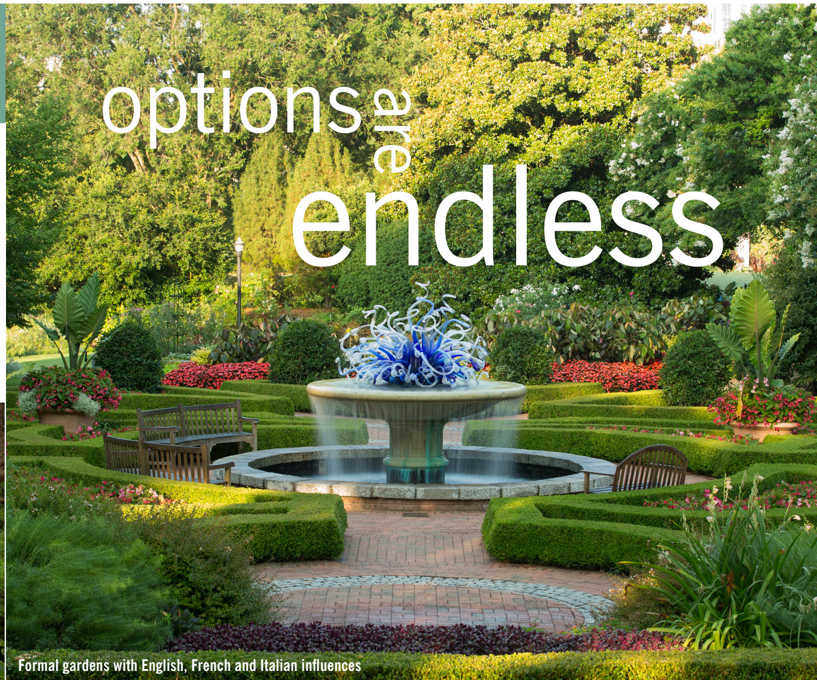
Formal gardens with English, French and Italian influences