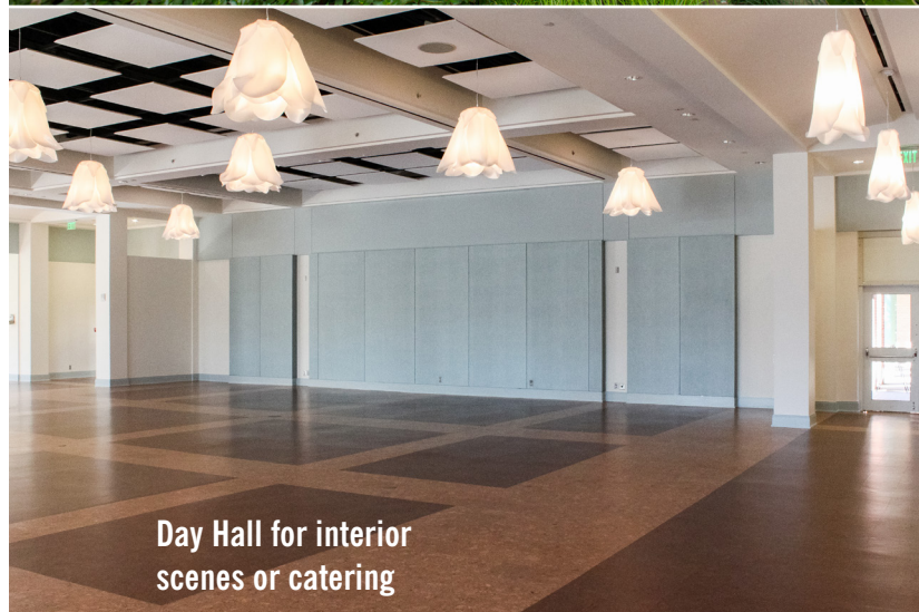
Day Hall for interior scenes or catering