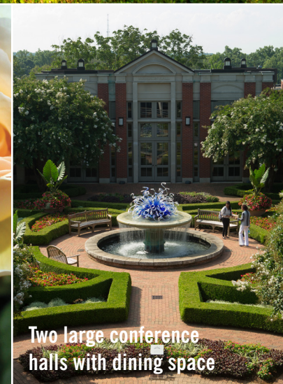
Two large conference halls with dining space