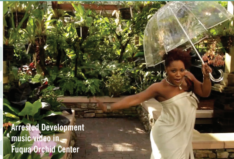
Arrested Development music video in Fuqua Orchid Center