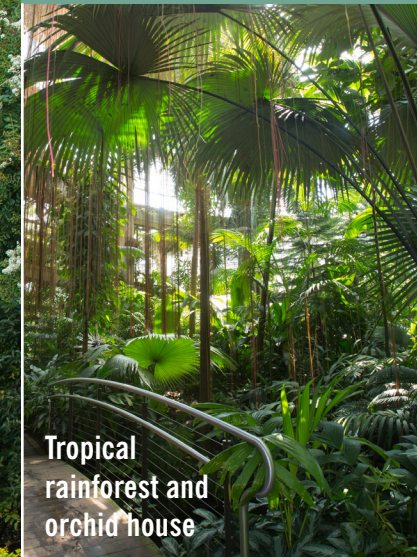
Tropical rainforest and orchid house